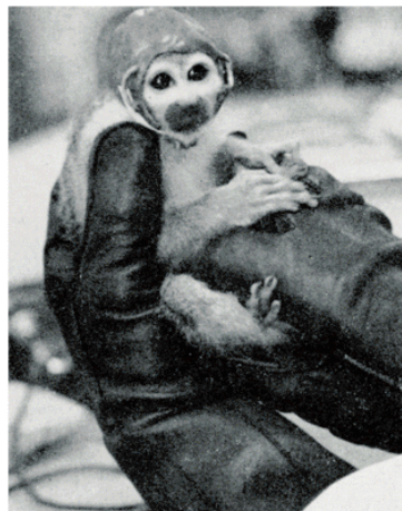
A squirrel monkey wears a special molded plastic helmet over leather like the one that protected Monkey Baker, one of two primates blasted into space on May 28, 1959.

SPACE FLIGHT SUCCEEDS — Two little monkeys, one clad in a space suit and the other lying in a special capsule with her knees drawn up under her, were blasted 300 miles into space on Thursday, May 28, from Cape Canaveral, Fla., the National Aeronautics and Space Administration has revealed. Drama of the experiment was heightened as U.S. Navy frogmen successfully snatched the missile nose cone from shark-infested waters in the Atlantic Ocean. This makes the animals the first monkeys known to have been shot into space and successfully retrieved.... The monkey experiment helps pave the way for "Mr. Mercury," one of the seven men to be chosen by NASA to ride the first manned space capsule in orbit.... Earth-bound scientists were able to study the effects of noise, acceleration, deceleration, vibration, rotation and weightlessness upon the two little monkey pioneers as they zoomed into space, then whistled back at 10,000 miles an hour to their Atlantic landing point.